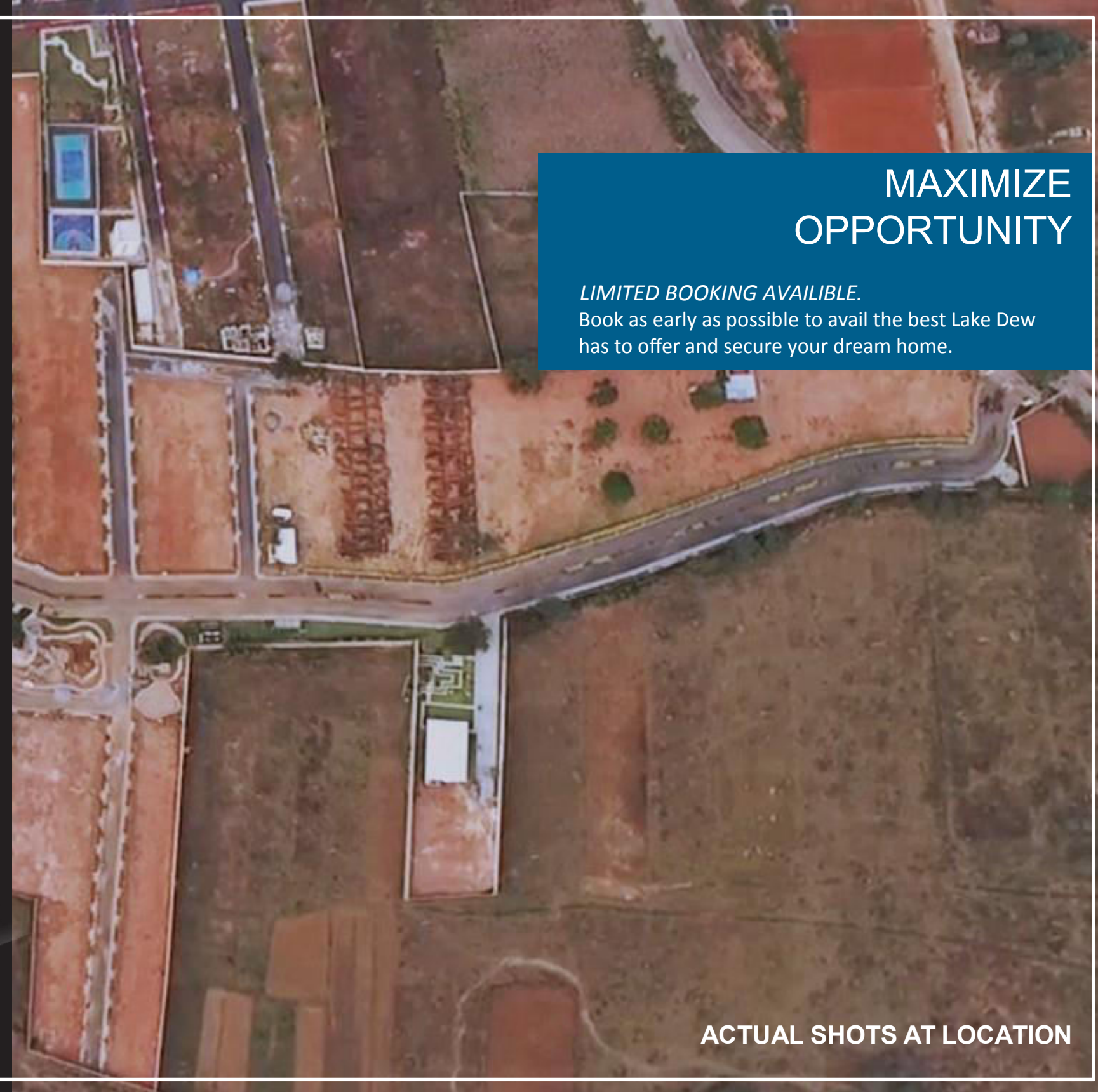
ACTUAL SHOTS AT LOCATION

LIMITED BOOKING AVAILABLE. Book as early as possible to avail the best Lake Dew has to offer and secure your dream home.