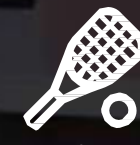
Indoor Squash Court