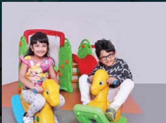
Kid's play area (Indoor)