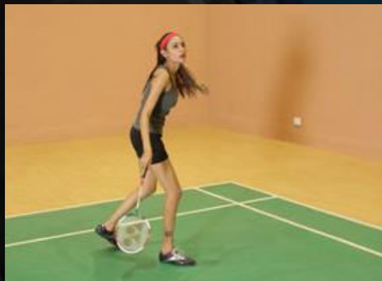
Indoor Badminton Court